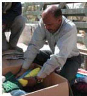
Health kits prepared by women of the ELCA are prepared for shipment at the Lutheran World Relief warehouse.

Quilts, health kits, school kits, soap, layettes, and sewing kits are among the needs. Then drop a note to Women.ELCA@elca.org to let us know how you are responding.