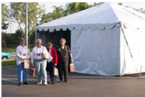
Are you sure we're meeting here?