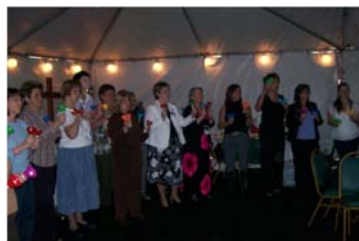
SUNDAY Worship with Crystal Bells